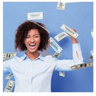
Financial Aid: Most students are eligible for fee waivers, grants and/or scholarships. Find out what you qualify for.