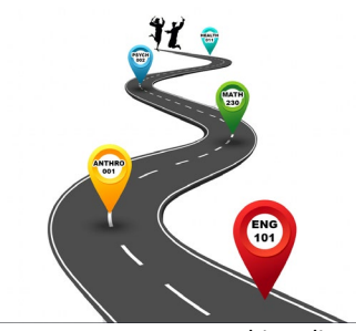
Program Mapper: Use this online tool to identify a major and career. Also find which classes you need to take.