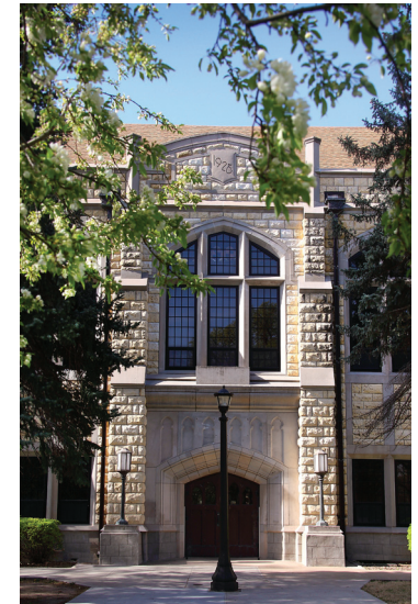
FHSU's College of Business & Leadership, McCartney Hall