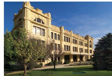
FHSU's Sheridan Hall, Administration

*Source: Bureau of Labor Statistics 2009 wage data and 2008-2018 employment projections. "Projected growth" represents the estimated change in total employment over the projections period (2008-2018).