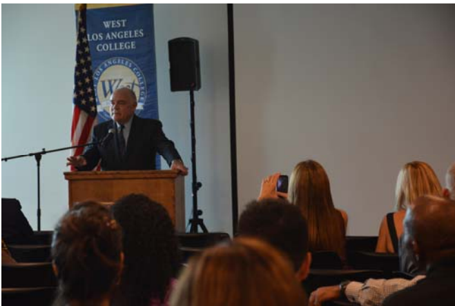
The new Veterans Services Support Center at West.