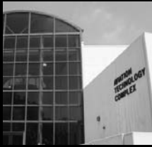
ATA / ATB