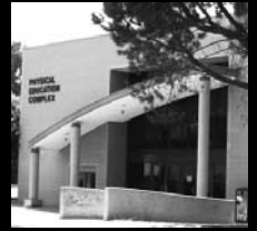
PEC / N / S