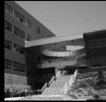
MSA / MSB