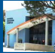
PEC / N / S