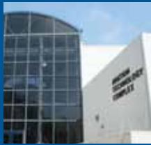
ATA / ATB