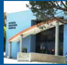
MSA / MSB