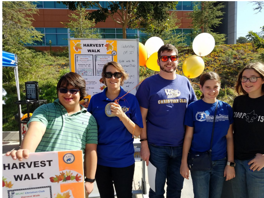
HARVEST WALK AROUND CAMPUS